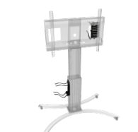
Universal PC bracket