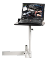
Swivel arm for notebooks