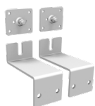
2 galvanized wall mounting brackets