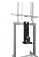
Camera shelf for DCS system