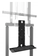
Keyboard tray for DCS system