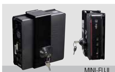
Lockable mini PC bracket