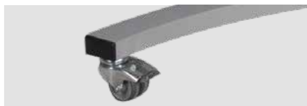
Smooth running & lockable castors