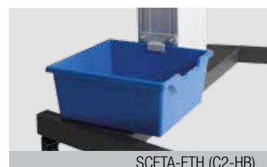
2 box holders (boxes on request)