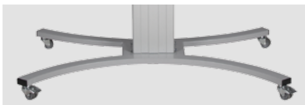
C-shaped mobile stand