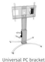
Universal PC bracket