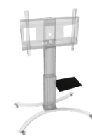
Laptop side shelf