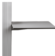
Side shelf for laptop