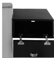
Lockable notebook cabinet