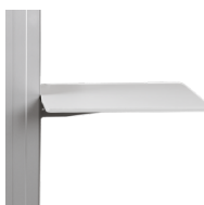
Side shelf for laptop