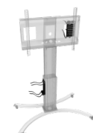
Universal PC bracket