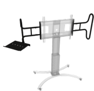
Two large and sturdy handles including laptop shelf