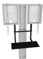
Keyboard shelf for LITE series