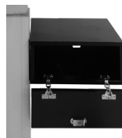
Lockable notebook cabinet